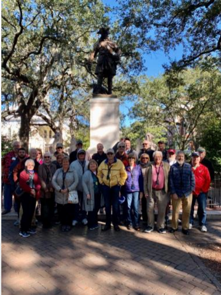
MRRT Group: James Oglethorpe Statue